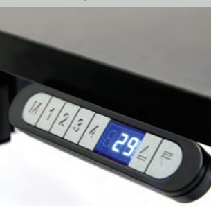
EASY TO USE CONTROLLER